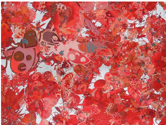
Bugz + Drugs, Command-Q, 2018. Cotton, polyester, lurex. Tapestry (detail).

Galería Elvira González is pleased to announce Small World , the first solo exhibition of Pae White in Spain opening on June 6.