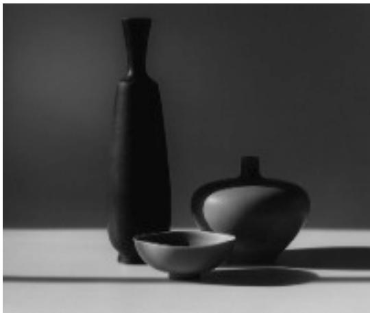
RM Glass Collection , 1984, 50,3 x 40,5 cm Impresión en gelatina de plata. Ed. 8/10 (*)

The show, which forms part of the PHotoEspaña Off Festival, will be on view at Galería Elvira González until July 19th.